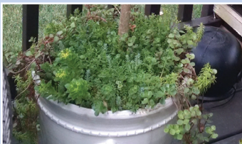
Planters & Bowls